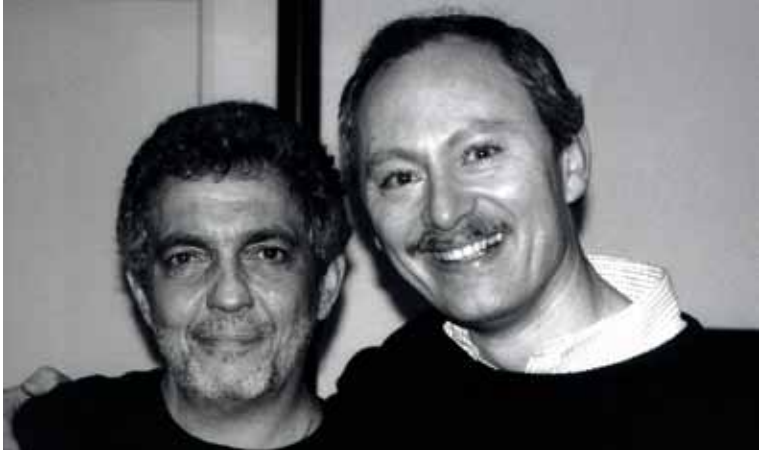
df.S General Manager Andy Witte with drum legend Steve Gadd, 2-8-1998 in Stuttgart.

Ideally situated in Stuttgart's city center, Germany's second largest drum school has four glass-walled studios and an integrated training room 250 m 2 in size. Eight teachers give 250 hours of training per week. In addition, the new Drum Point in-house shop offers top-quality products spanning new and used instruments, professional consulting and qualified repairs. df.S is easily accessible and is just a short walk away from the train station passing through Stuttgart's prime address for shopping, coffee and, of course, drumming!